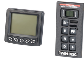
TDEC-500 ELECTRONIC CONTROL SYSTEM